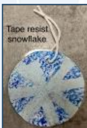
Tape resist snowflake