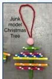
Junk model Christmas Tree