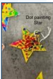
Dot painting Star

The children created some fabulous decorations and helped to make our tree look really special. It was a pleasure to use the children's beautiful decorations to represent our Federation at this special community event.